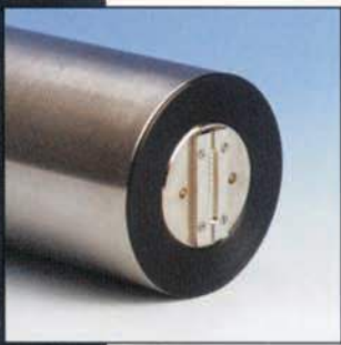
EM-Printhead small (7 nozzles)