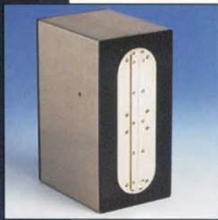
EM-Printhead big (64 nozzles)