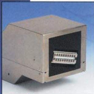
Piezo-Printhead big (352 nozzles)

The EBS 1500 series are controllers that operate modular, separate from the printhead. The available printheads are in a high quality steel housing and with Electromagnetic-technology (EM - up to 64 dots) or with Piezo-technology (Piezo - up to 352 dots).