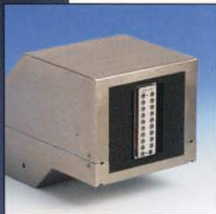
Piezo-Printhead small (192 nozzles)